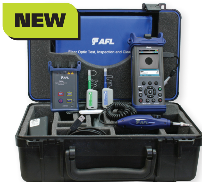
M210 QUAD Certification Kit (Tier 1 and Tier 2)