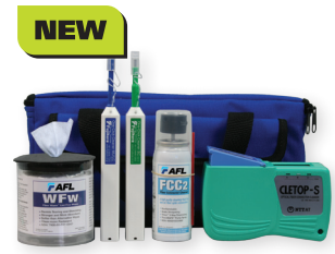
FCP2-00-0900 Basic Cleaning Kit