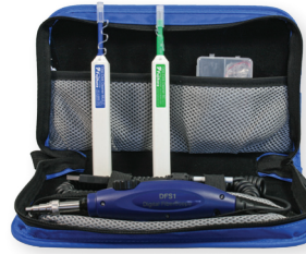
DFS1 FiberScope Inspection Kit