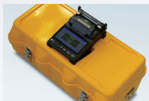
Place & Splice!