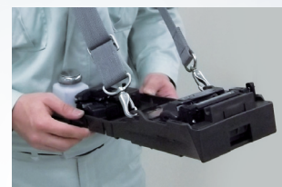
Sling & Splice!