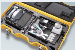
Open & Splice!